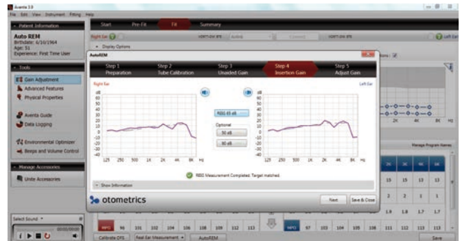
AURICAL makes verification easier with automated fitting to target from within the hearing instrument fitting software ReSound Aventa® using AutoRem and Phonak Target™ using TargetMatch.

Learn more about AURICAL at www.otometrics.com/aurical